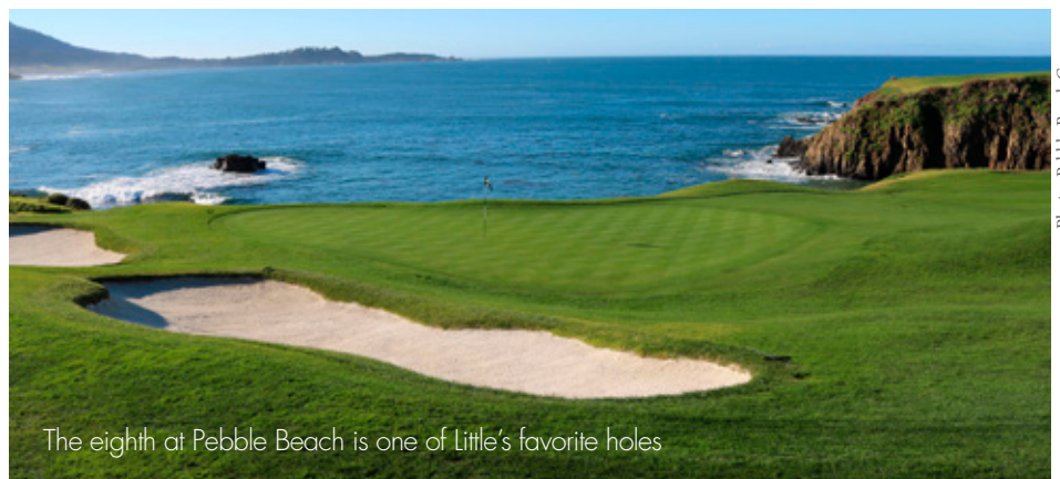
The eighth at Pebble Beach is one of Little's favorite holes

We are thrilled with the ASGCA Foundation's new Longleaf Tee Initiative, so our family foundation has pledged US$75,000 to support the project. ●