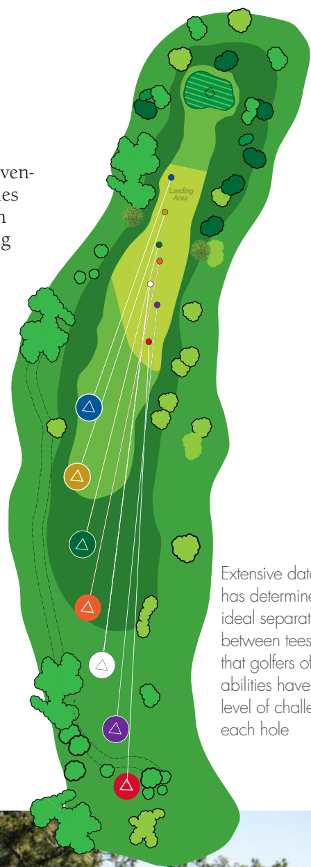
Extensive data analysis has determined the ideal separation between tees to ensure that golfers of varying abilities have a similar level of challenge on each hole

The back tees and more heavily-used middle tees may hold more than one set of markers each, and are respectively about 800 sq. ft. and between 900-1,200 sq. ft. each. The forward two-to-three sets of tees are smaller, approximately 400 sq. ft. each.